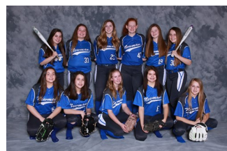
2019 Lady Comets Fresh/Soph Softball Team