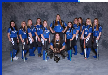
2019 Lady Comets Varsity Softball Team