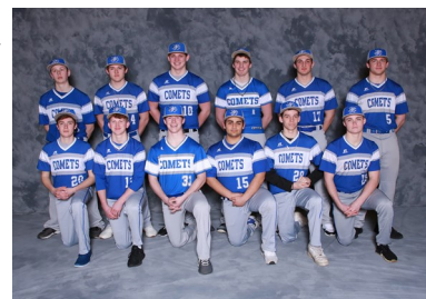
2019 Varsity Boys Baseball Team

play baseball at Sauk Valley Community College.