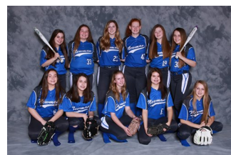
2019 Lady Comets Fresh/Soph Softball Team